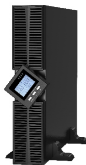
Display panel can be rotated